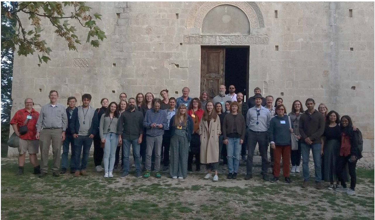
Participants of the course “Radiation Belt Dynamics and Remote Sensing of the Earth's Plasmasphere”

The IUGG financial support was used for the course organisation and for supporting the participation of students from Poland, Brazil, and France at reduced rates.